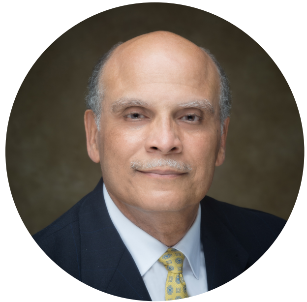
NC A&T State University